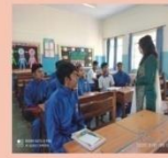
Extra Classes for NDA, Sainik School/RIMC/RMC