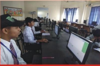
Center Board of Secondary Education, Aryabhata Ganit Challenge