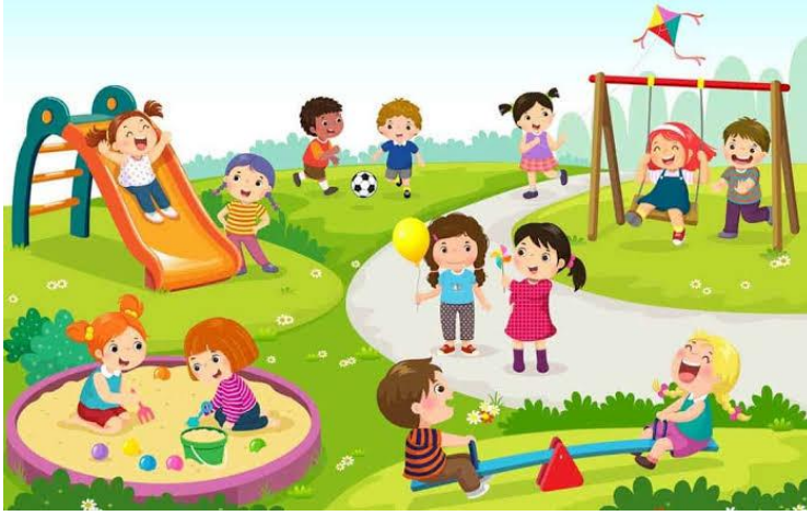
Children, playing, swings, happy, friends, kite, flying, enjoying, football, balloon, see-saw.